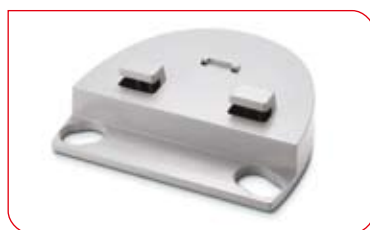
The seca 437 adapter element connects the stadiometer to a flat scale.