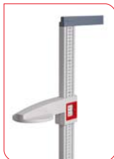
The spacer provides extra stability and ensures precise measurement results.

The mobile stadiometer seca 217 can be used anywhere, thanks to its sturdy and large base plate. All the connections are very stable and the spacer between wall and rod prevent the rod from wobbling and trembling, movements which impair measurement accuracy. All these features make this stadiometer the ideal tool for anyone who needs a reliable measuring device for use at different locations.