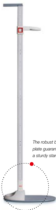
The robust base plate guarantees a sturdy stance.

The collapsible height measuring rod of the stadiometer seca 217 can be put together quickly and simply in just a few steps and attached to the stable platform. There's no need to attach the rod to the wall. It's easy to step onto the large base plate, which has no raised sides or edges.